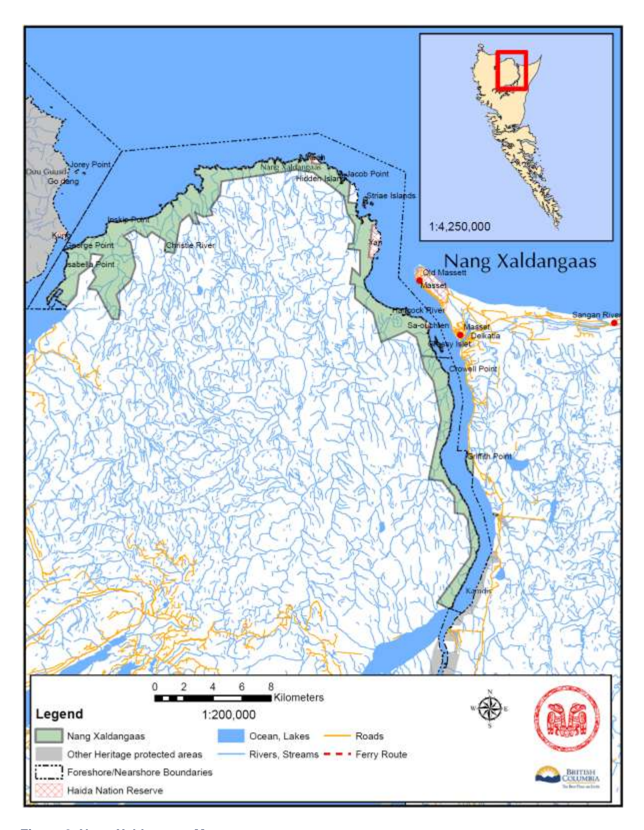
Figure 2. Nang Xaldangaas Map